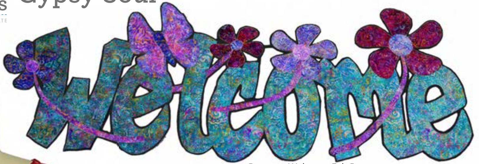
Pattern: Welcome Felt Runner by The Fat Quarter Gypsy