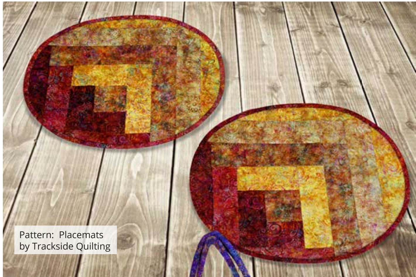
Pattern: Placemats by Trackside Quilting