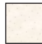
30177 E Binding