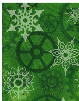
28905 G Gears & Snowflakes