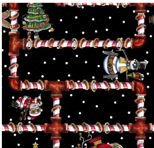
28903 J Candy Cane Pipes (6")