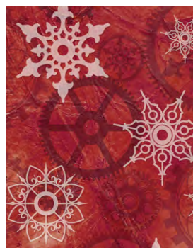
28905 R Gears & Snowflakes