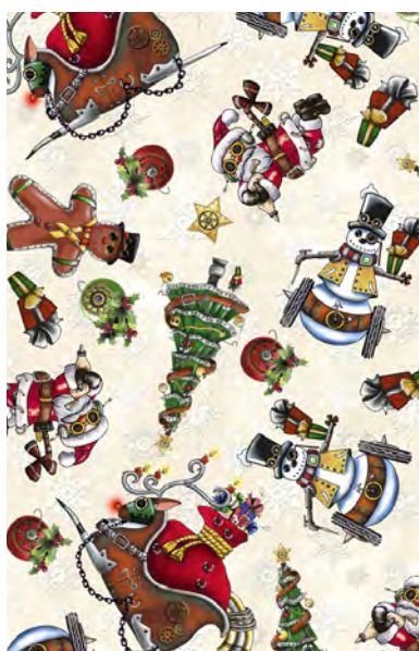
28902 E Steampunk Christmas Toss