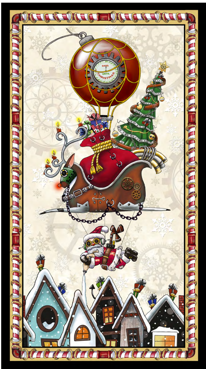
28900 E Steampunk Christmas Panel (24")

M4132 ALL15 0 16542 32421 4 15 YARD PUT UP