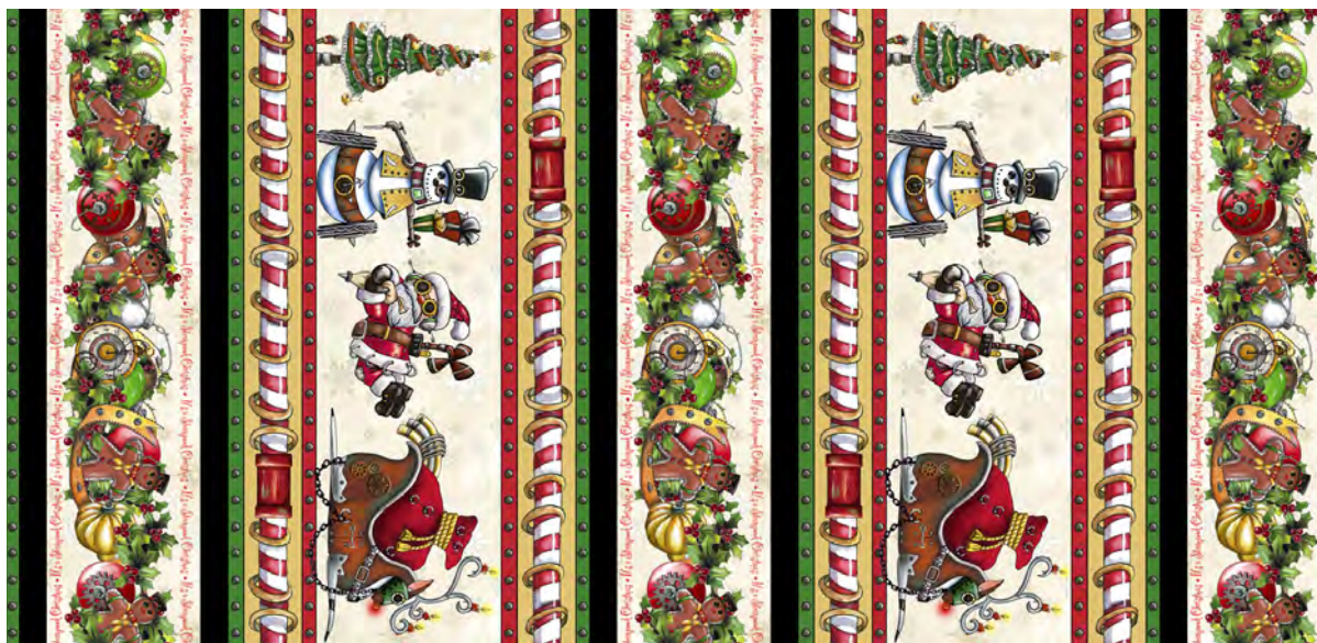
28901 E Steampunk Christmas Stripe (12")