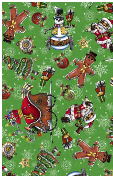
28902 G (24") Steampunk Christmas Toss