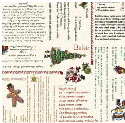
28904 E Recipes (12")