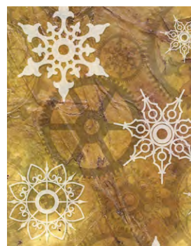
28905 S Gears & Snowflakes