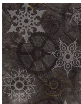
28905 K Gears & Snowflakes