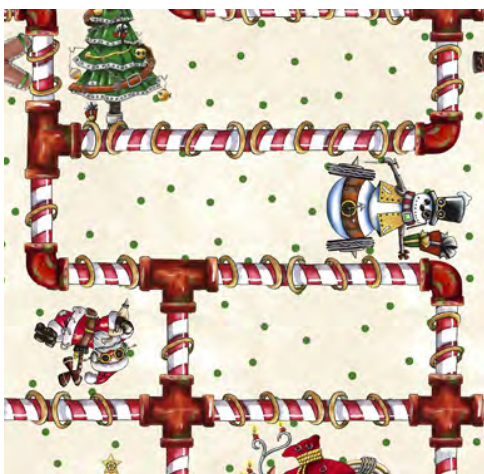
28903 E Candy Cane Pipes (6")