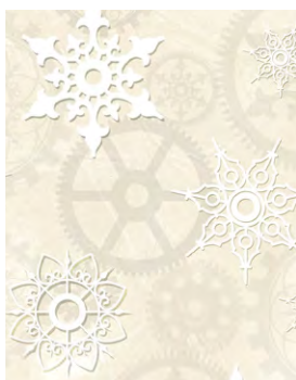
28905 E Gears & Snowflakes