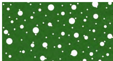
28906 G Dots (4")