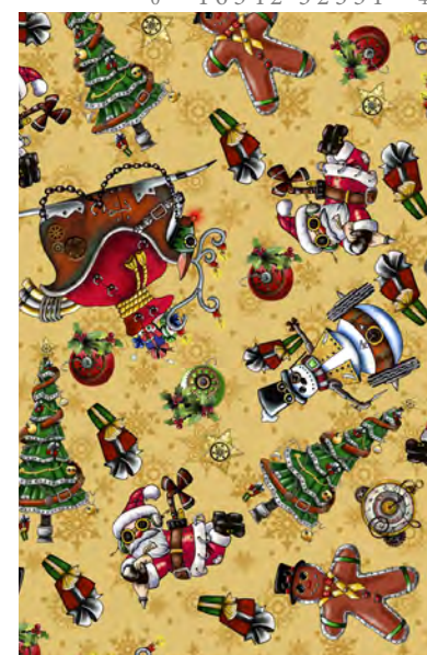
28902 S Steampunk Christmas Toss