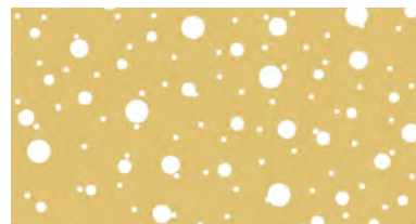
28906 S Dots (4")