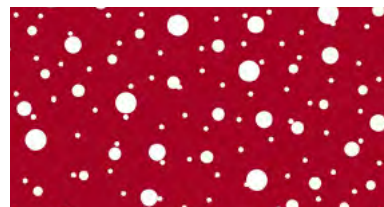
28906 R Dots (4")