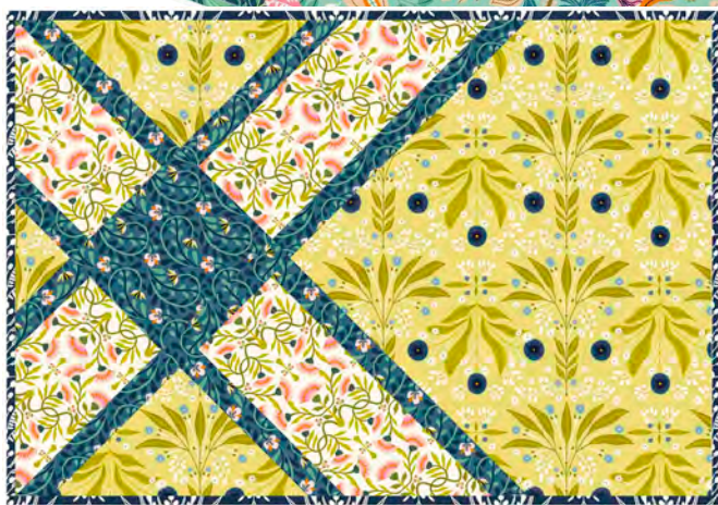
Table Crossings Pattern by Poorhouse Quilt Designs